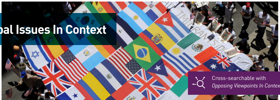
"Thousands turn out for a May Day march and rally in support of immigrant rights in Los Angeles."

Created especially for students and researchers studying Canada, its people, and its history, this product spans the North American continent to deliver a full range of specific topics. Users can explore biographies of Canadian figures as well as information on technology, sports, industry, and more delivered from a Canadian perspective. Curriculum-aligned content includes encyclopedias, CBC videos, NPR audio selections, global news feeds, and articles from more than 370 Canadian newspapers and magazines.