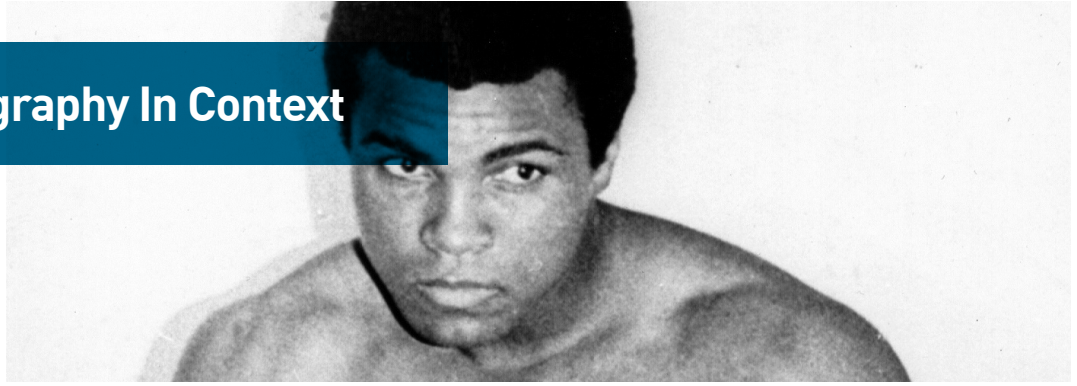
"Undated photo (pre-1976) of boxing champion Muhammad Ali (Cassius Clay) in boxing outfit."